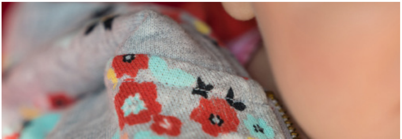
Increase out of focus features and background separation when using wider lenses and higher T-stops.